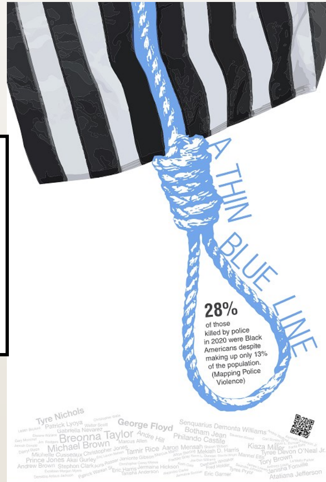
Title: Thin Blue Line (right)