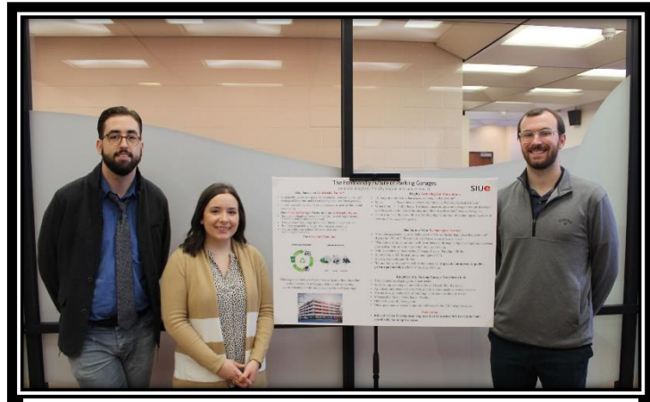
IMAGE 4 THREE ADDITIONAL STUDENTS AND THEIR POSTER ON ECOFRIENDLY GARAGES

The overall goal while building with adaptive reuse in mind is to create an economy that is less linear, meaning there is less of a 'take-make-waste' model of production. Adaptive reuse means to make use of an existing structure for something other than its intended use once it is no longer useful by its original purpose. A circular economy, in contrast to a linear one, promotes the reuse and refurbishment of waste to create a closed-loop