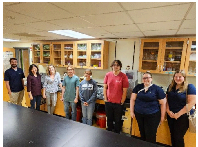
The NCERC team visits the students of FLCC