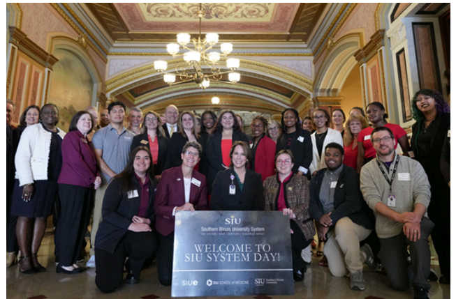
SIU System Day was hosted at the Capitol Building