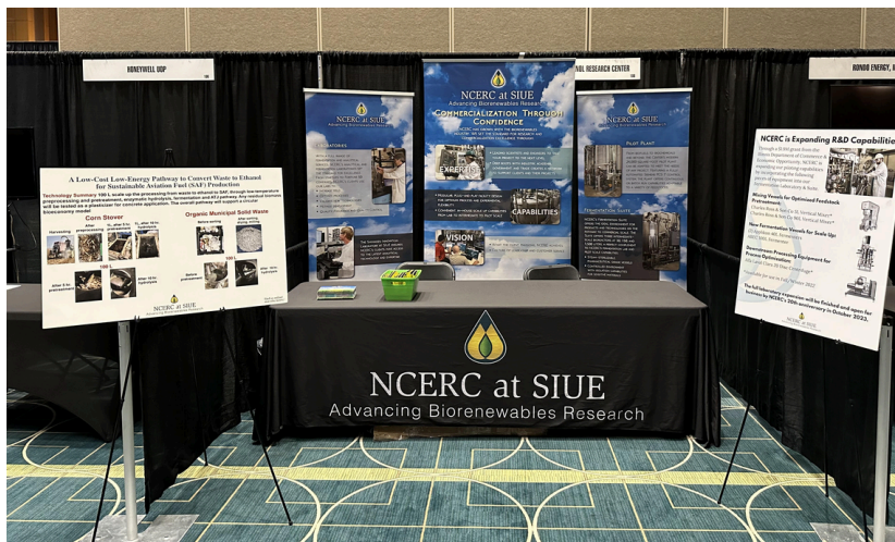
The NCERC booth at the 2023 North American SAF Conference