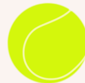
A tennis ball = 1/2 cup