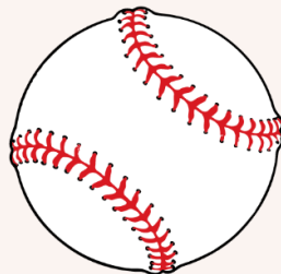
A softball = 2 cups