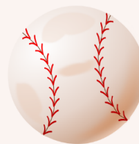
A baseball = 1 cup