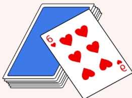
A deck of cards = 3 oz serving of protein

There are many other resources you can use to measure aside from your hand or an actual measuring cup.