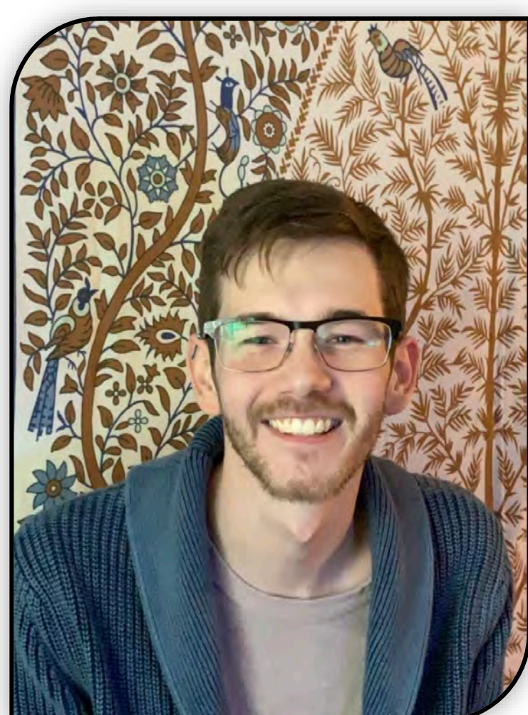
River Jordan Graduate Academic Achievement Award